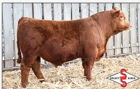
RSF ELECTRIFY L46