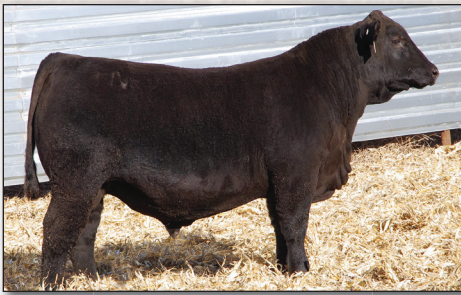
TNT PERFECTION L496