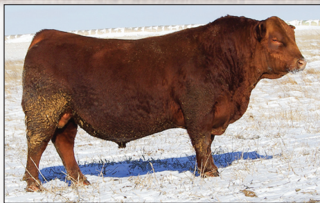
CDI ELEVATION 302K