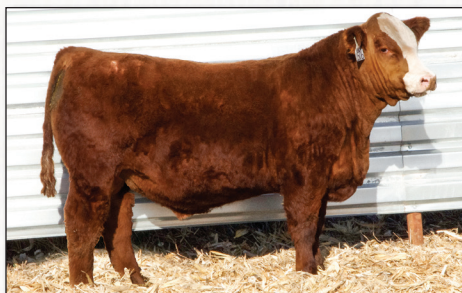
TNT CRUSADER L506