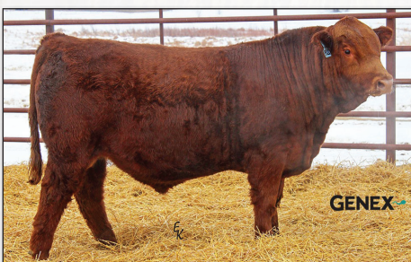
KS CALIBRATE K209