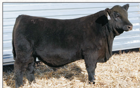
TNT ELDERADO L406