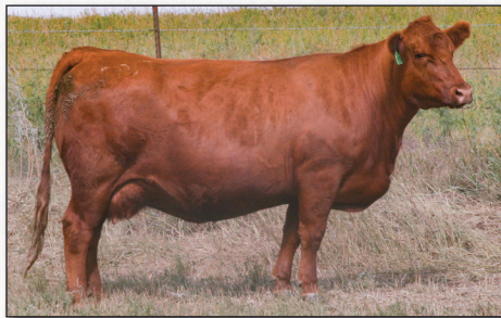
Dam to TNT Ignite & TNT Dozer