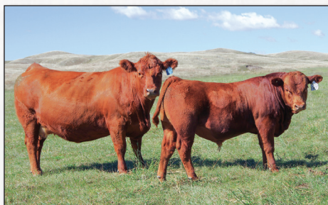
Dam to Lot 90 and His Full Brother