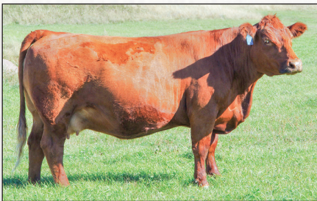
Dam to TNT Smokeshow and Lot 105