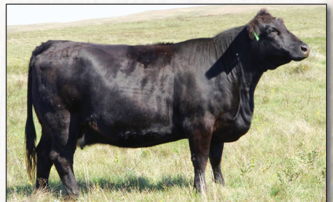
Dam to Lot 38