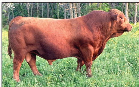
TNT DOZER F439 SEMEN AVAILABLE