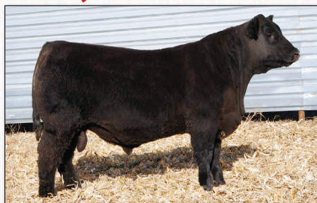
TNT DYNASTY L671