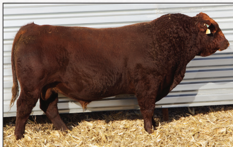
CHSR WAYMAKER 93J