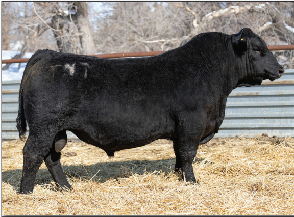
TNT Assurance J455