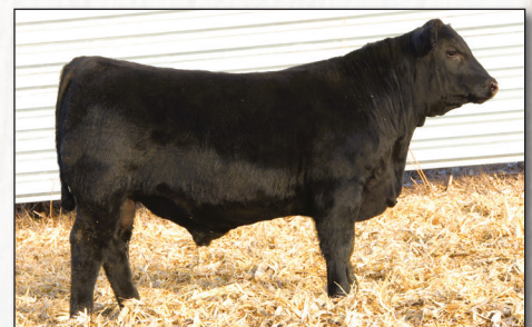
TNT REST EZ L659