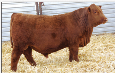
TNT FRONT RUNNER K609