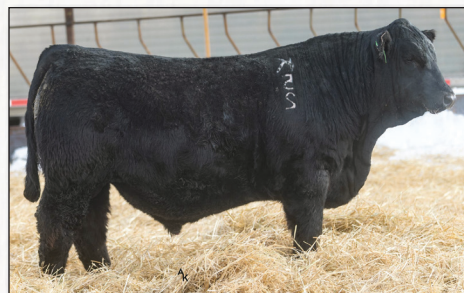
QB QUANTIFY K52