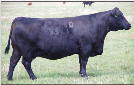
Dam to TNT Unified and Granddam to Lots 55 & 79