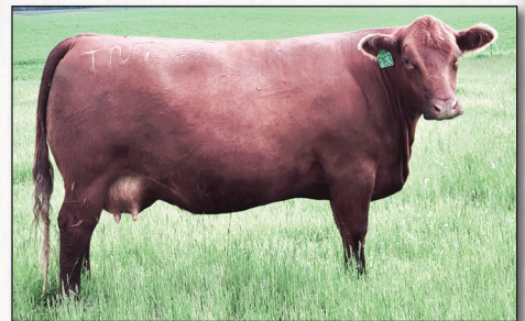
Dam to TNT Regal and Lot 103