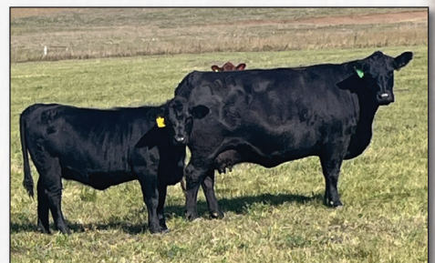
Dam to TNT Comfort Zone and Lot 40 with her Acceleration Heifer