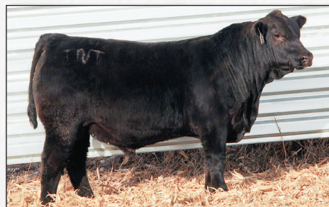
TNT MARKSMAN L500

6 – View video of every bull on our website or Facebook!