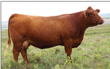
Dam to Lot 107