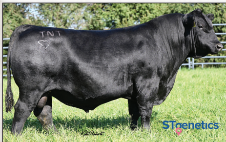
CLEMSON ELITE 41J SEMEN AVAILABLE THROUGH ST GENETICS