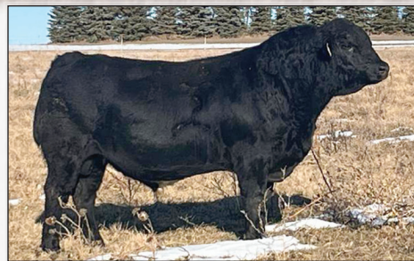
BRIDLE BIT EFFICIENT J160 SEMEN AVAILABLE