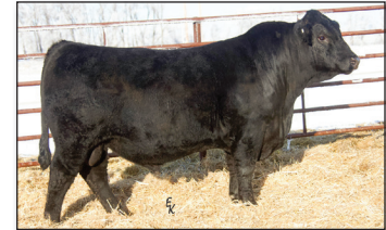
TNT Resolution L436