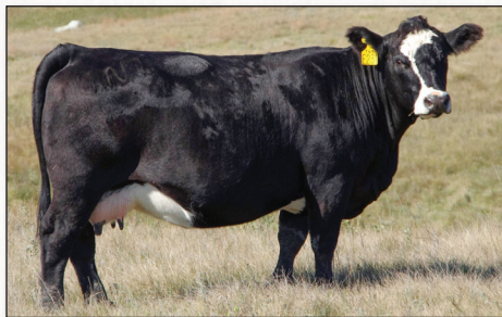
Dam to TNT Long Range, TNT Perfection & TNT Marksman