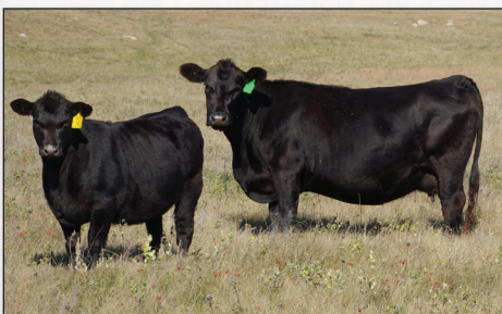
Dam to Lot 80 & TNT Exemplify with His Full Sister, who is the Dam to Lot 61