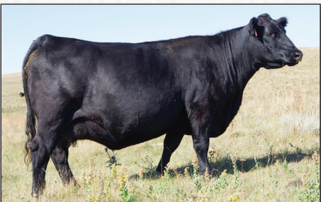
Dam to Lot 86