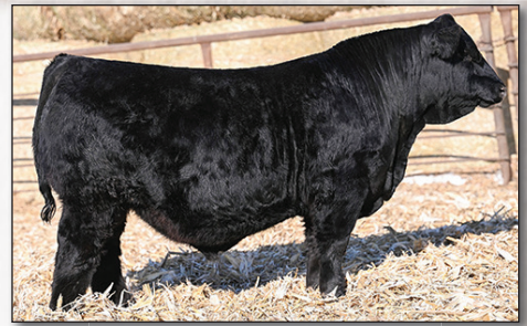
WINC LEADING EDGE 227K