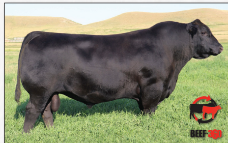
MILLARS DUKE 816