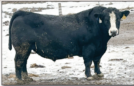
TNT TRADEMARK K629 SEMEN AVAILABLE