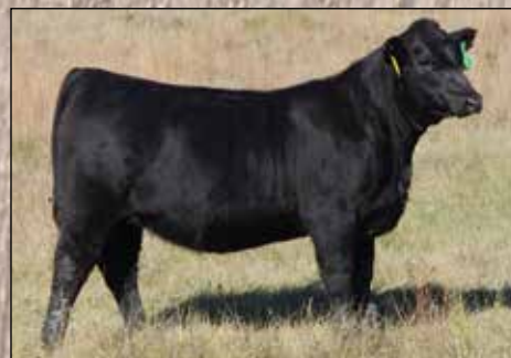
Maternal Sister to Lot 77