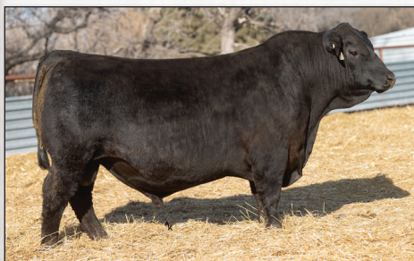
TNT EXEMPLIFY K508 SEMEN AVAILABLE