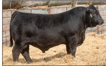
TNT Plateau L683