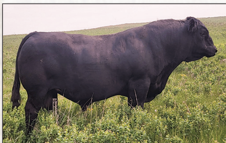
MR NLC TESTAMENT 2661K