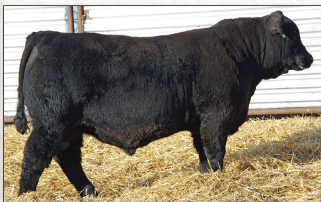
TNT COMFORT ZONE J328 SEMEN AVAILABLE