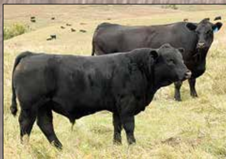
Lot 48 and His Dam