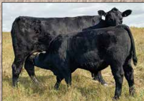
Lot 88 and His Dam