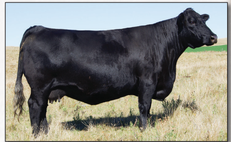
Dam to TNT Tactic and Lot 79